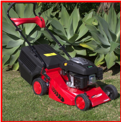
T484GGP Powered by GGP 160cc Overhead Valve Engine