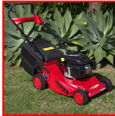
T484K Powered by Kohler XT-6 149cc Overhead Valve Engine