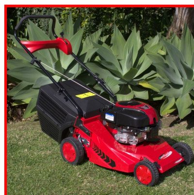
T484B&S Powered by Briggs & Strat- ton 750 Series 1/C DOV 161cc Engine