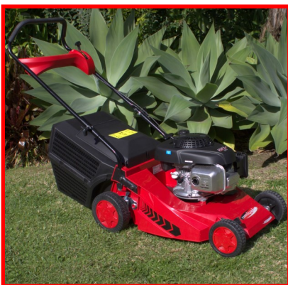
T484H Powered by Honda GCV160 160cc Overhead Valve Engine