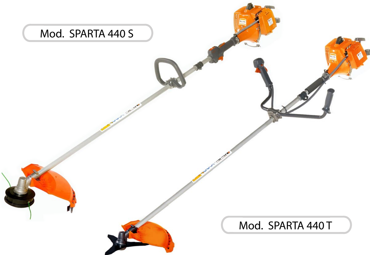
Mod. SPARTA 440 T

The new Sparta 440 brushcutter is designed to offer high efficiency and unfaltering quality over time, even in the face of heavy and prolonged use. The new professional 2-stroke engine, alluminium drive shaft (Ø 28 mm) with steel shaft (Ø 8 mm), 6 flexible bushings, 3 teeth disc cutter. The machine incorporates numerous features and is ideal for tough jobs like cutting thick grass, clearing brushwood, and thinning reed beds. Every detail has been designed with care to render brushcutting duties easy and effortless, even for the inexperienced user, the pluses are: